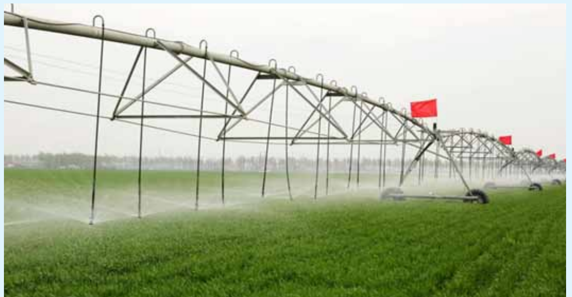
A 500-meter-long self-propelled truss sprinkler irrigates a wheat field in Lique township, Guangrao county, Dongying city, east China's Shandong province, April 11, 2022.

According to Xu, The Agricultural High-tech Industrial Demonstration Area of the Yellow River Delta has built a germplasm resource bank, serving as a solid foundation for subsequent efforts to breed saline-alkali tolerant plant varieties. Up till now, the bank has collected a total of 15,000 copies of germplasm resources covering domestic and foreign halophytes of 89 species, 42 genera and 13 families, with the types of the salt-tolerant plants including food crop, forage grass, medicinal plant,