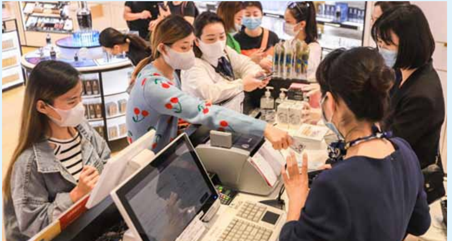
Customers buy duty-free goods at the Global Premium Duty Free Plaza, Haikou city, south China's Hainan province, Nov. 11, 2021.

To build a unified national market, the country needs to stimulate the