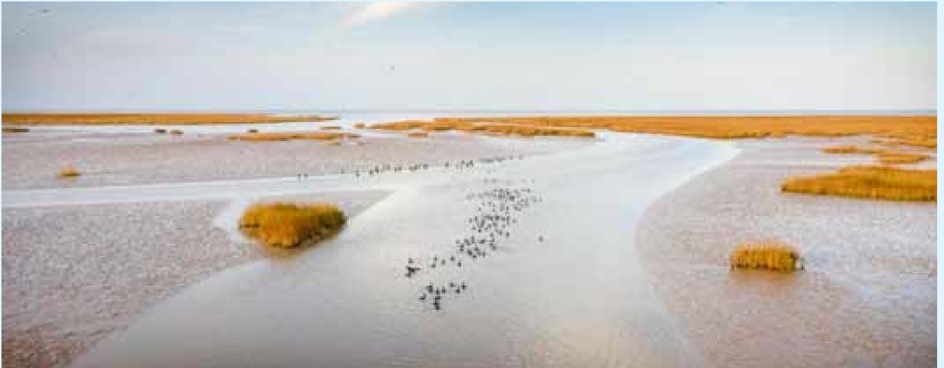
Photo shows wetlands of the Yellow River Delta National Nature Reserve in east China's Shandong province.