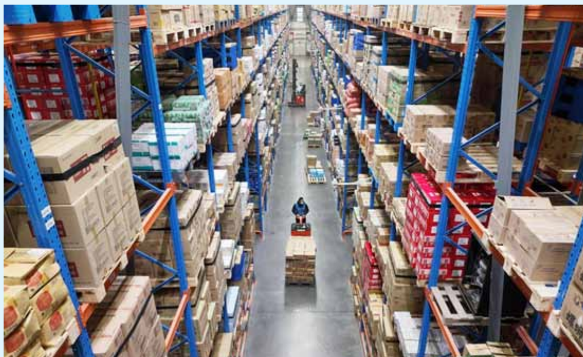
Logistics workers are busy transferring products in Fancheng district, Xiangyang city, central China's Hubei province, Jan. 17, 2022.

By accelerating the construction of a unified national market, creating more market demands, releasing greater consumption potential, expanding circulation space and forming a more transparent business environment, the country will stabilize market expectations, promote sustainable and healthy economic development, and make its economy more vibrant and dynamic.