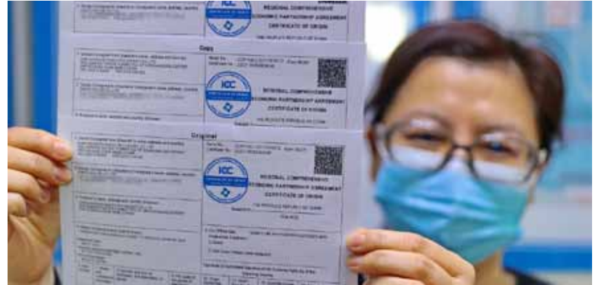
A staff member with the trade promotion council of Qinhuangdao, north China's Hebei province, shows the first certificate of origin under the Regional Comprehensive Economic Partnership (RCEP) issued by the council, Jan. 28, 2022.