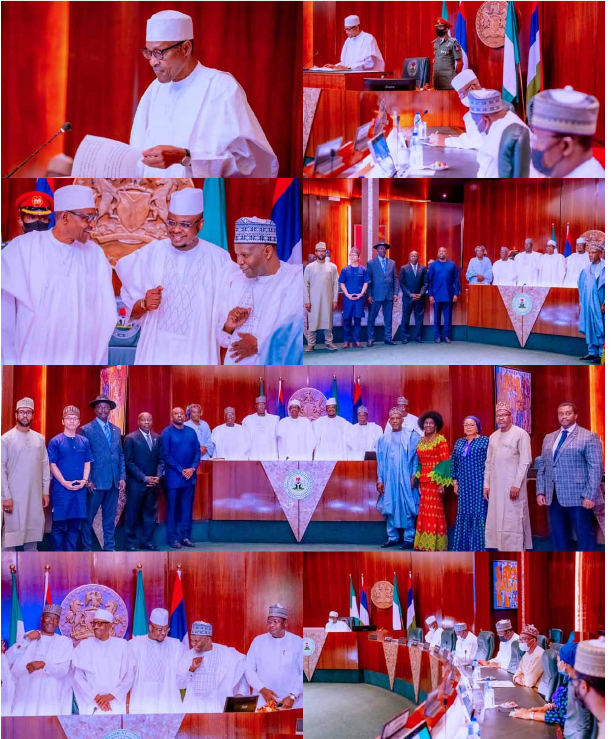
President Muhammadu Buhari inaugurates Presidential Council on E-Government and Digital Economy in State House on 10th June 2022 President Buhari with SGF Boss Mustapha, Minister of Communication and Digital Economy Prof. Isa Pantami, Gombe State Governor Inuwa Yahaya and Exec. Vice Chairman NCC Prof. Umar Danbatta