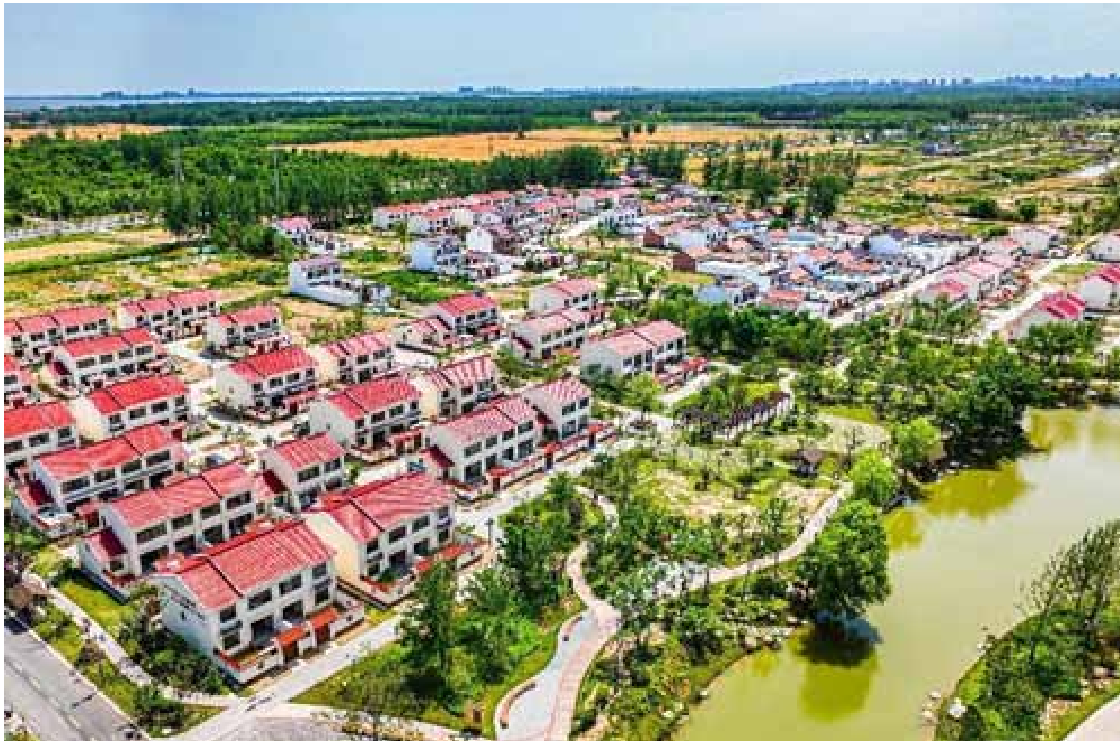
Photo shows a new type of rural residential community with a pleasant living environment in Suqian city, east China's Jiangsu province, May 30, 2022.

practical actions to fulfill its solemn commitment to make sure that no country or individual is left behind and no aspiration is overlooked in development.