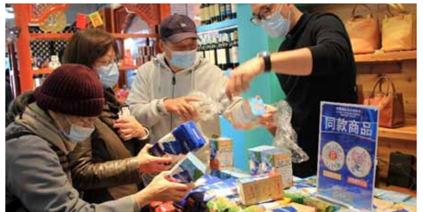
Tourists purchase commodities introduced into China through the China International Import Expo (CIIE) at a "CIIE bazaar" on Nanjing Road Pedestrian Walkway, east China's Shanghai municipality, Nov. 8, 2021.