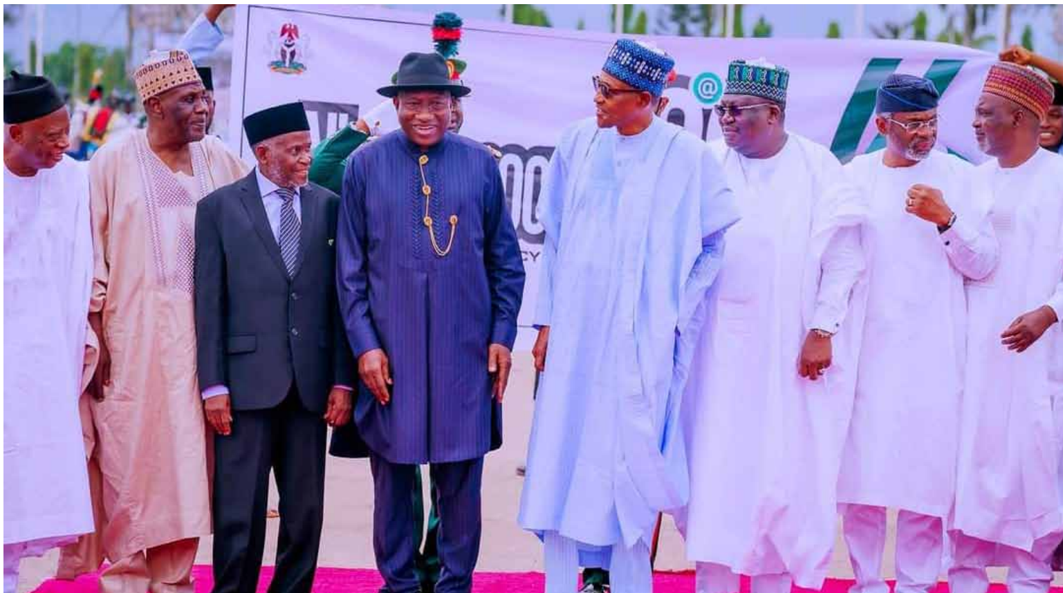
President BUHARI at the 2022 Democracy Day Celebration at the Eagle Square, ABUJA. President Buhari with L-R: Minister of Defence Maj. Gen. Bashir Magashi (Rtd), SGF Boss Mustapha, APC National Chairman Abdullahi Adamu, Special Envoy to Lake Chad Amb. Babagana Kingibe, Chief Justice of Nigeria Justice Ibrahim Tanko Mohammed, Former President Goodluck Jonathan, Senate President Ahmed Lawan, Speaker Femi Gbajabamila, Deputy Speaker Admed Idris Wase, COS Prof. Ibrahim Gambari, FCT Minister Muhammad Bello and Dean of Diplomatic community and High Commissioner of Cameroon Amb. Salabeddine Abbas.

Troops kill bandit on Kaduna-Abuja highway