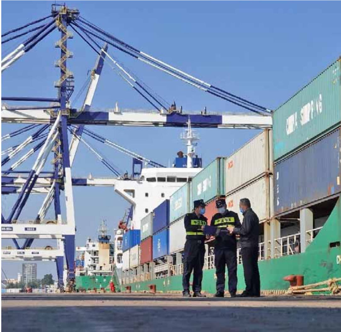
Customs officers inspect foreign trade containers at an international container terminal of Yantai Port, east China's Shandong province, Oct. 12, 2021.