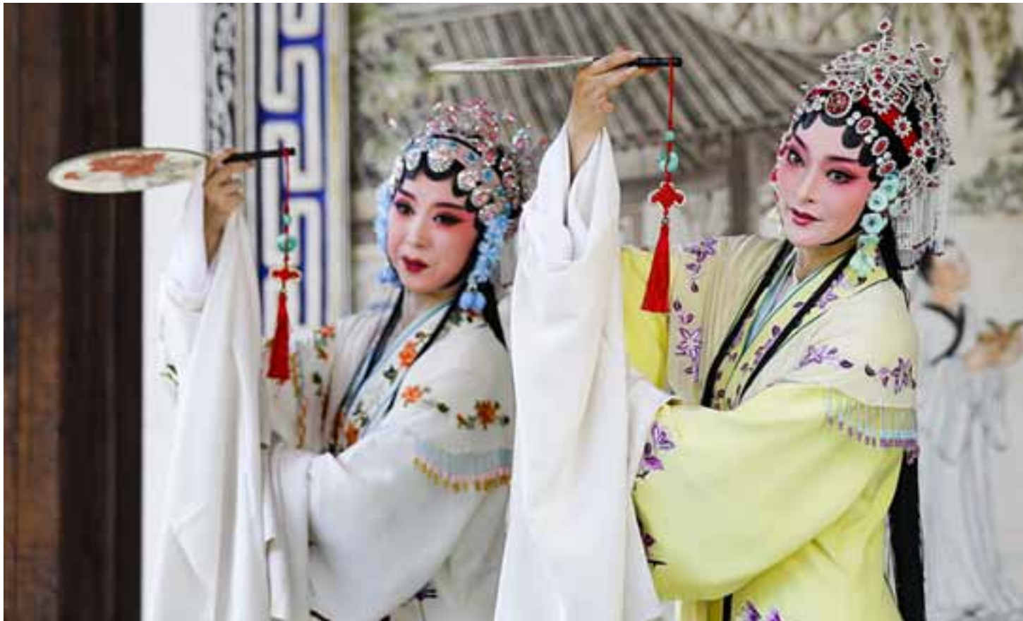
Photo taken on July 7, 2021, shows actresses performing Min Opera, national-level intangible cultural heritage of Fuzhou, southeast China's Fujian province, at a waterside pavilion in Sanfangqixiang, a historic and cultural area in Fuzhou.