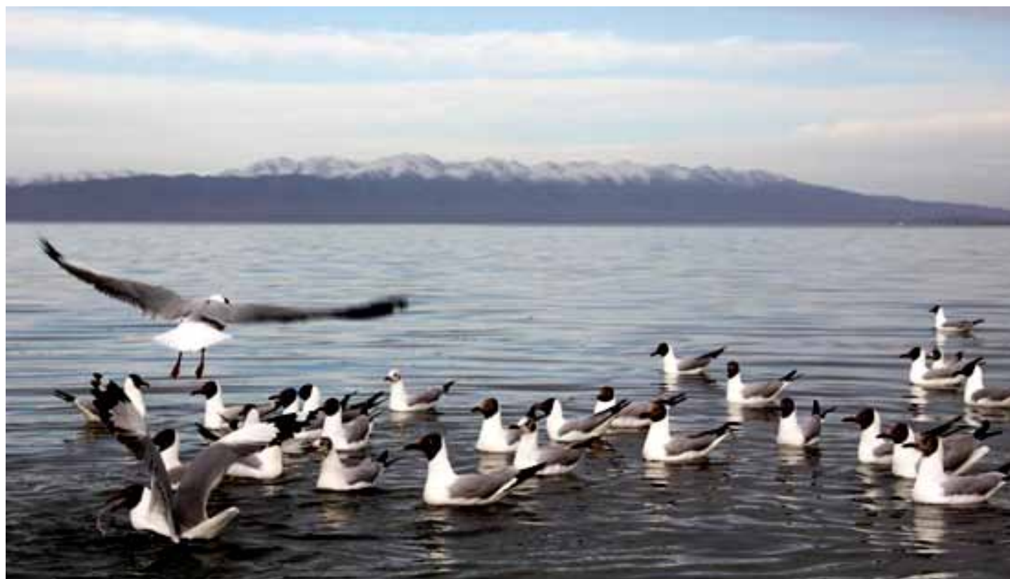
Photo taken on May 20, 2021 shows birds swimming in Qinghai Lake, northwest China's Qinghai province.