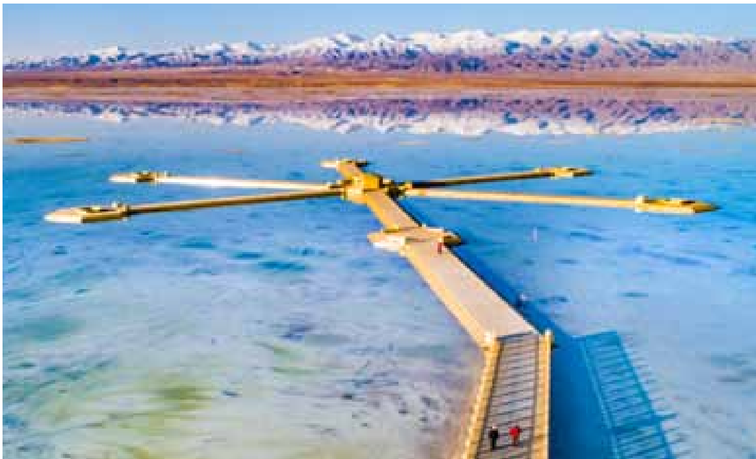
Photo shows the splendid scenery of the Chaka Salt Lake, a popular tourist destination in northwest China's Qinghai province.