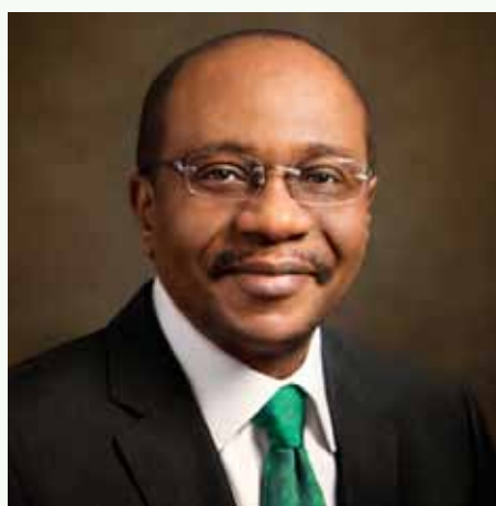
Emeifele, CBN Governor

The project name is tagged Project GIANT and it will use the Hyperledger Fabric Blockchain. Nigeria's central bank further revealed that the importance of eNaira includes Macro management and growth, cross border trade facilitation, financial inclusion, monetary policy effectiveness, improved payment efficiency, revenue tax collection, remittance improvement, and targeted social intervention.