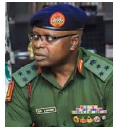
NYSC DG, Brig. Gen. Shuaibu

According to report, the corps members swept and cleared wastes in the markets and at motor parks in Lafia metropolis.