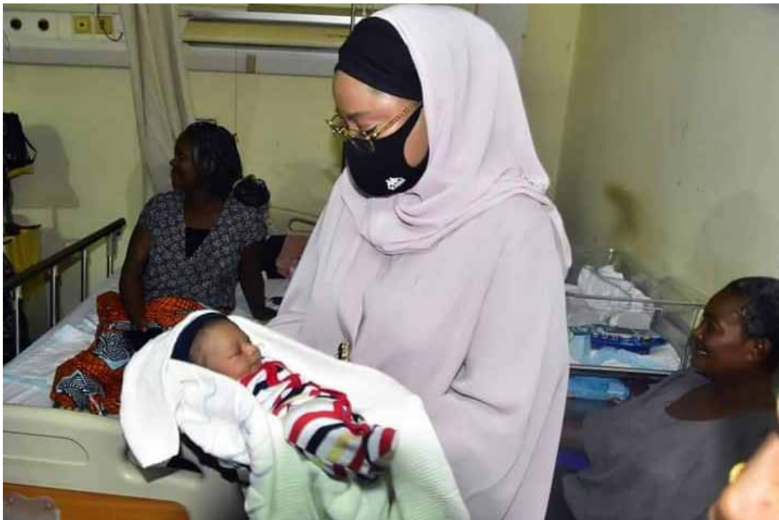
FCT Minister of state Dr Ramatu Tijjani Aliyu during extension of support to indigent family with multiple births at the National Hospital Abuja recently