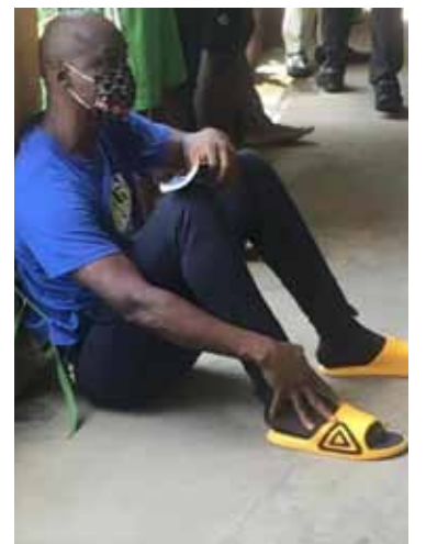
Nollywood actor Baba Ijesha