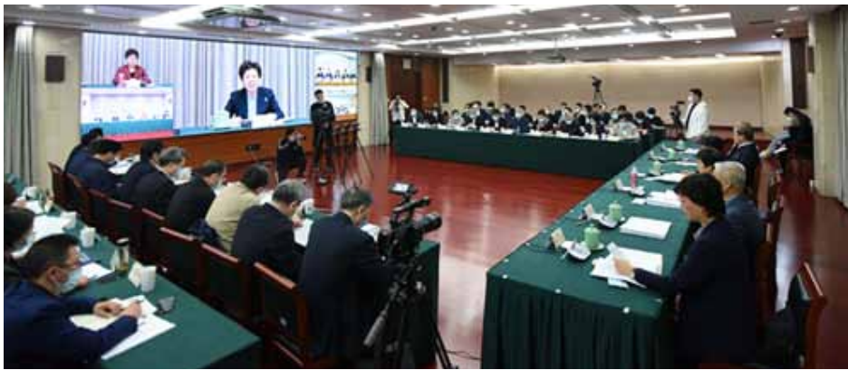
The Zhejiang Provincial Committee of the Chinese People's Political Consultative Conference holds a meeting on promoting the comprehensive treatment of plastic waste in Hangzhou, east China's Zhejiang province, March 30, 2021.