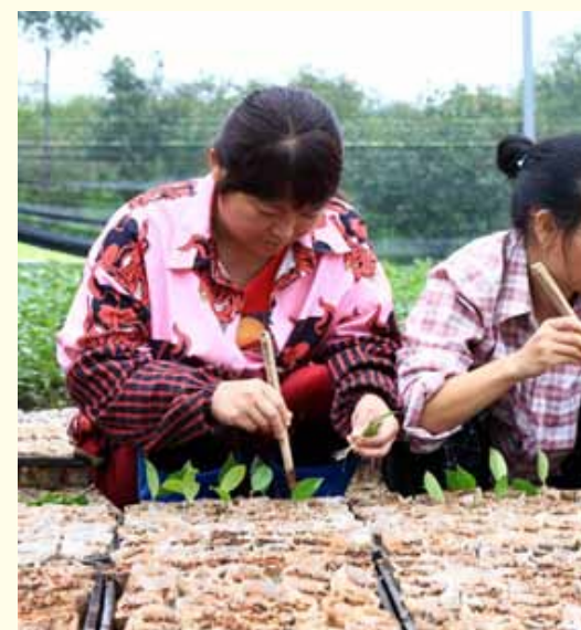
A member of a Communist Party of China voluntarily works in planting camellia seedlings in Yongfeng county, Ji'an, east China.

It was written in the Manifesto of the Communist Party by Karl Marx and Friedrich Engels that the proletarian movement is the self-conscious, independent movement of the immense