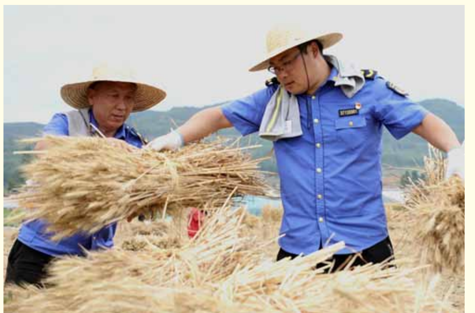
Members of the Communist Party of China help villagers harvest wheat in Yinan county, east China's Shandong province, June 9, 2021.