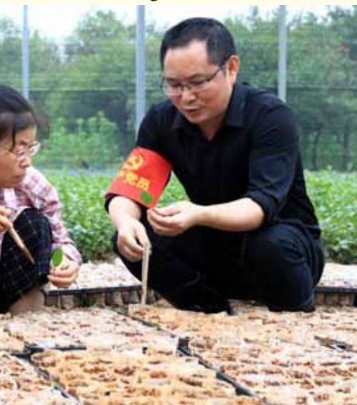
Leader group instructs farmers to graft and cultivate in China's Jiangxi province, May 18, 2021.