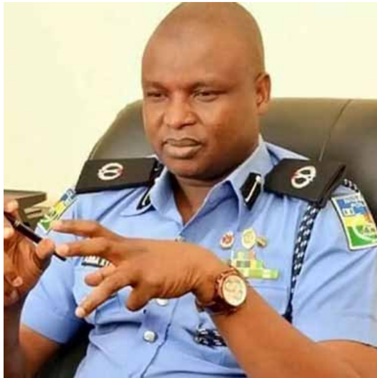
DCP Abba Kyari

The Miyetti Allah Cattle Breeders Association of Nigeria, (MACBAN) has condemned the Northern Elders Forum (NEF) for