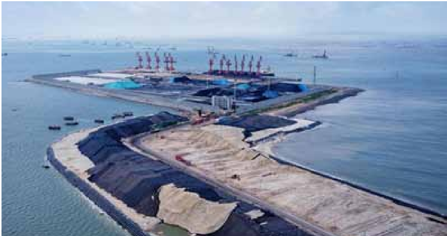
Photo taken on June 13, 2021, shows the construction site of the eastern shipping route extension project at Qinzhou Port in south China's Guangxi Zhuang autonomous region. The project aims to build a 100,000-ton two-way shipping route that stretches 23.34 kilometers at the port.