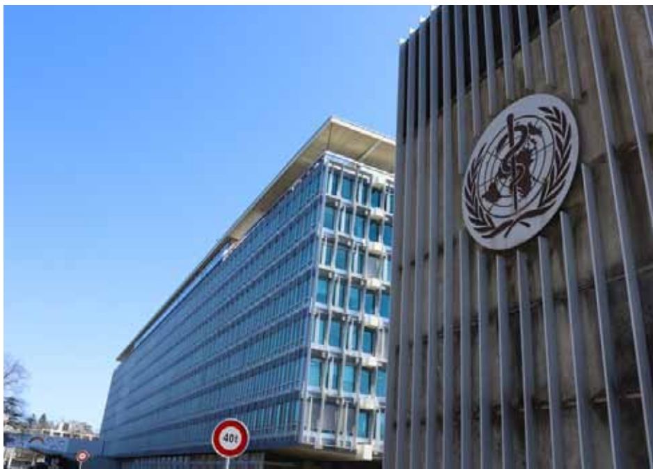
Photo taken on March 30, 2021 shows an exterior view of the headquarters of the World Health Organization (WHO) in Geneva, Switzerland.

(Zhong Sheng is a pen name often used by People's Daily to express its views on foreign policy and international affairs.)