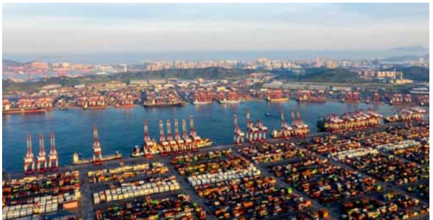
Photo taken on July 24, 2021, shows the busy Qianwan Container Terminal in Qingdao, east China's Shandong province.

"We have cultivated the first batch of hybrid fry, and will try to develop high-quality new varieties that grow fast as soon as possible to help farmers obtain greater economic benefits," Ji noted.