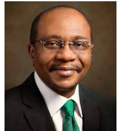
Emefiele, CBN Governor

surprising that since the CBN began to sell foreign exchange to Bureau De Change, the number of operators has risen from a mere 74 in 2005 to over 2,700 in 2016 – and almost 5,500 BDCs as of today (July 27, 2021)," Emefiele said.