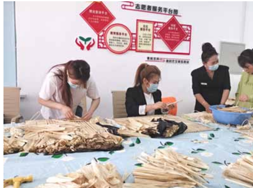
Photo taken on May 28, 2021, shows a straw plaiting skills training course arranged by the women's federation of Jiaohe city, northeast China's Jilin province.

To help sell the handicrafts, Jilin province has adopted an order-based training model, under which enterprises place orders for handicrafts from training bases before training sessions and women make relevant