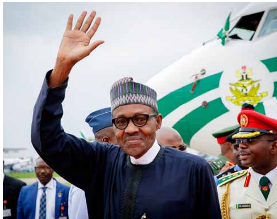
Buhari Returning from UK trip

He spent two weeks in the United Kingdom during which he attended an international summit on education as well as visited his private doctors for