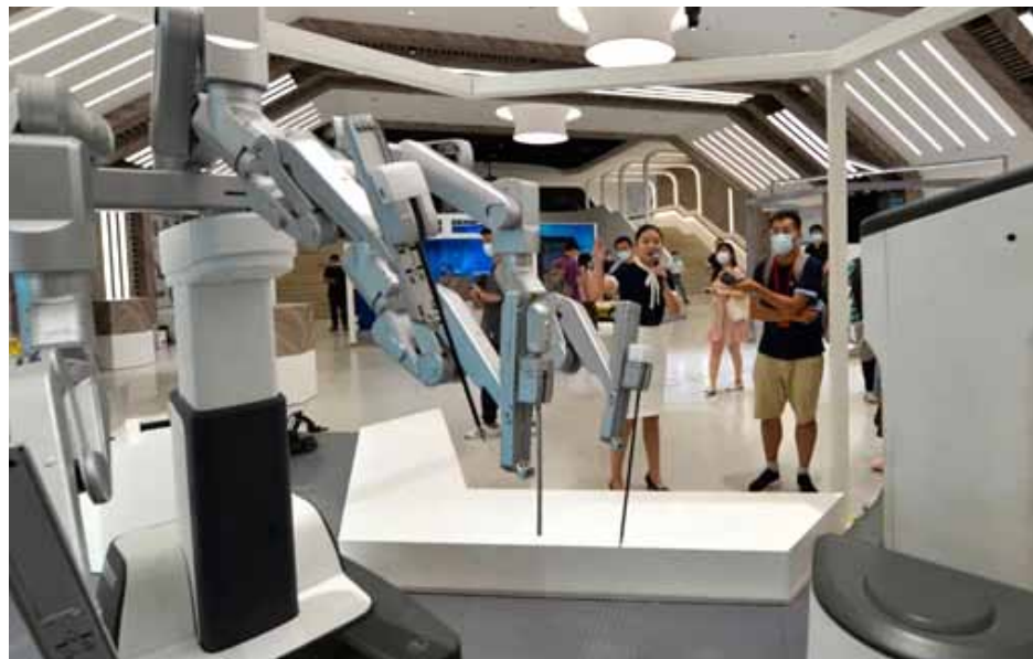
Photo shows Zhangjiang AI Robot Valley Future Experience Hall in Zhangjiang township, Pudong New Area, east China's Shanghai.

An entrepreneurial team led by Wang Weifeng, a postdoctoral researcher who has returned to China after studying abroad, got approval of medical devices within merely 70 days.