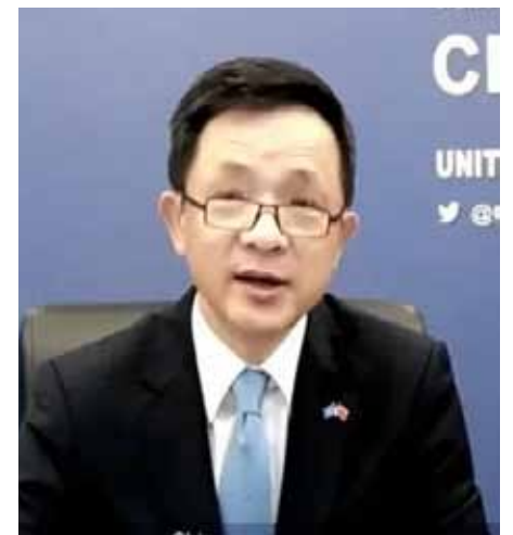
China's deputy permanent representative Dai Bing

China since the beginning of this year. What's more, the U.S. abuses bilateral military agreements that smack of the Cold War to threaten to use force on China. This exposes its power politics logic and hegemonic practices. It is self-evident who is seeking coercion and intimidation and threatening freedom and security of navigation. The so-called "not making a distinction between countries in and outside the region" recently raised by the U.S. disregards the justified and legitimate rights and interests of coastal states of the South China Sea. Former Malaysian Prime Minister Mahathir Mohamad once said that it is believed that China would exercise restraint on the issue of the South China Sea, but some unfriendly countries outside the region would try to provoke conflicts. Peace and stability is the common strategic objective of China and ASEAN countries. China has the resolve and capability to uphold national sovereignty and territorial security, and will continue working with regional countries to safeguard peace and stability in the South China Sea. We sternly urge the U.S. to stop its sinister ploy in the South China Sea, as any attempt to muddy the waters in the region is doomed to fail.