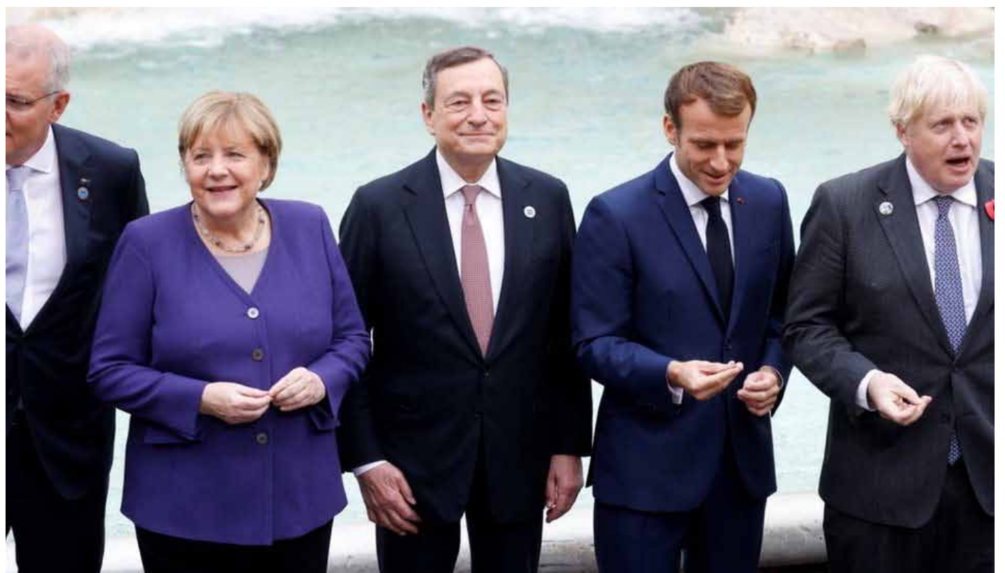
Leaders posed for a picture by the famed Trevi Fountain on Sunday morning

Gen Burhan, who was head of the power-sharing council, said Sudan was still committed to the transition to civilian rule, with elections planned for July 2023.