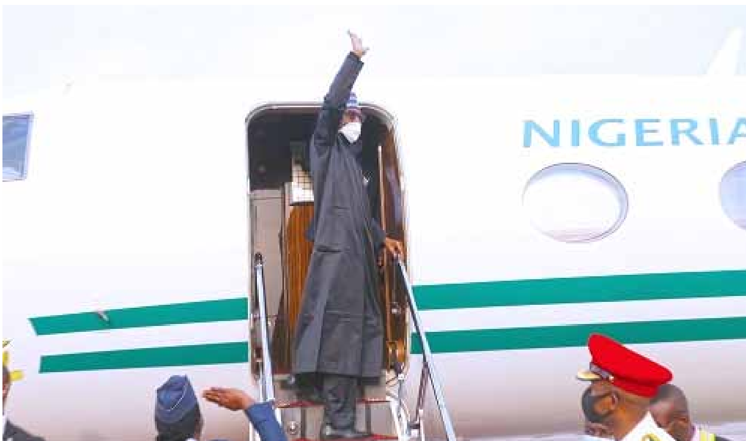
President Muhammadu Buhari off to Glasgow Scotland to attend global climate change summit.

IYC Fault FG Over N621bn Approved For NNPC To Construct 21 Federal Roads >>PAGE 9