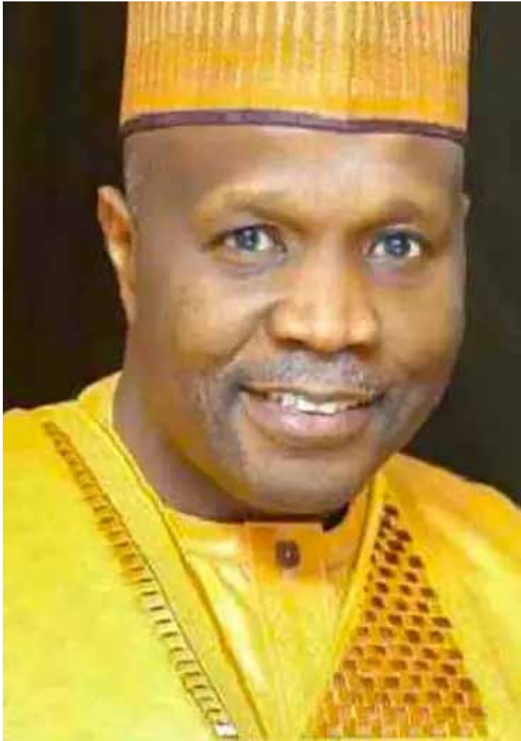
Gov. Inuwa Yahaya